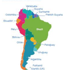
The countries of South America