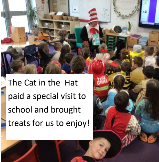
The Cat in the Hat paid a special visit to school and brought treats for us to enjoy!